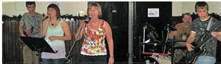
Great Lakes Church Worship Band

The Great Lakes Church meets at the Nord Middle School. Let's continue to pray for the Lord's favor on this new church.